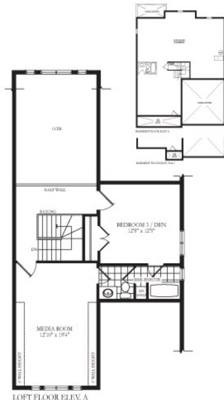
LOFT FLOOR ELEV. A

Spritsail A-2,091 sq.ft., B/C-2,062 sq.ft. Incl. 14 sq.ft. finished lower area